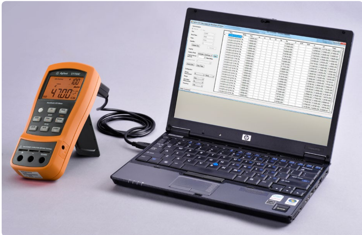
Figure 1. Automate the recording of continuous readings when you hook the U1731C/U1732C/U1733C to a PC

The handheld LCR meters allows you to test various component types, including secondary components of Dissipation Factor (D), Quality Factor (Q), and Angle Indication of Impedance ( \theta ). This new handheld series also includes other functions that result in a more detailed component analysis. For example, the built-in Equivalent Series Resistance (ESR) function helps you better understand the inherent resistance behavior typically found in capacitors across selected frequencies. DCR is a built-in DC resistance measurement that eliminates the use of a separate digital multimeter (DMM) for component test.