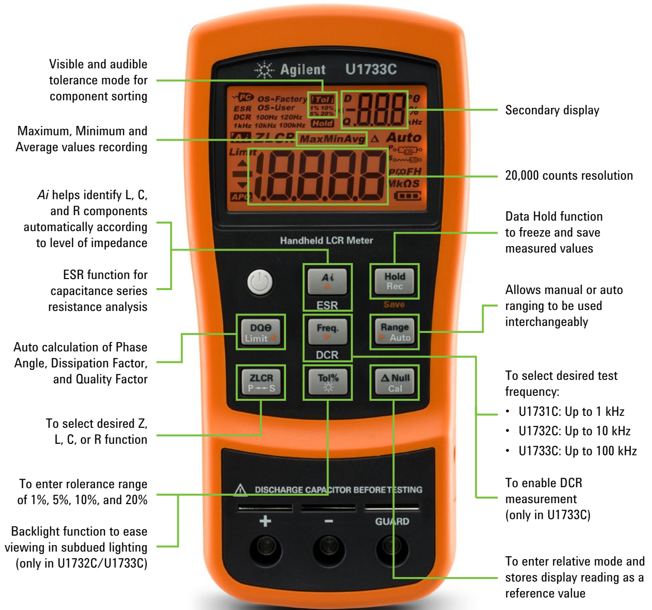
Figure 2. Front view of the U1733C